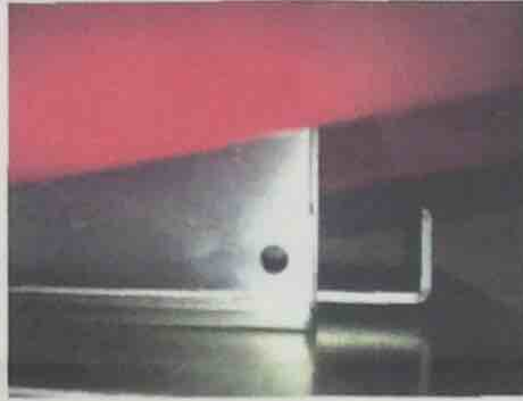
CORRECT FINAL POSITION