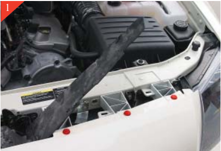
1 Tape Grille shell using masking tape to protect during install. Remove (6) plastic rivets across core support. Remove top Core Support covers