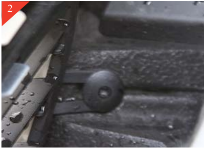
2 Then Remove (1) (square drive) screw in each corner driver & passenger side that is holding the bottom of the grille into the energy absorbent foam.