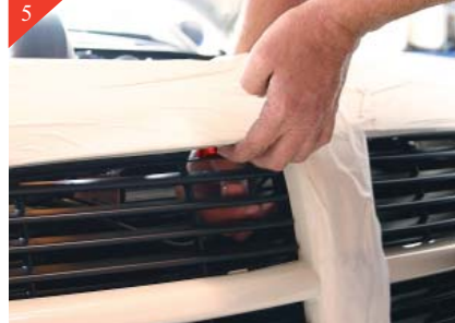
5 Pull on factory grille and release (2) upper tabs from slots and remove factory inserts. One of the tabs is shown above in Red.