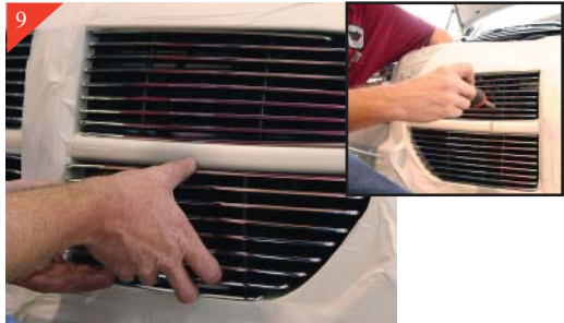
9 Place lower inserts into grille shell and fasten to the L-brackets (Step 8). Next attach the upper & lower billet grilles together using the Long bracket (Step 7) using supplied hardware #8 x 5/8". Next tighten all screws. Then re-install Core Support Covers.

For installation of billet grilles that require cutting of the stock shell, proper tools, knowledge and skill are needed. Carriage Works is not responsible for care & accuracy of the installation, only for Fit & Finish of its products. Use a qualified installer or contact original vendor for references to complete all instructions.