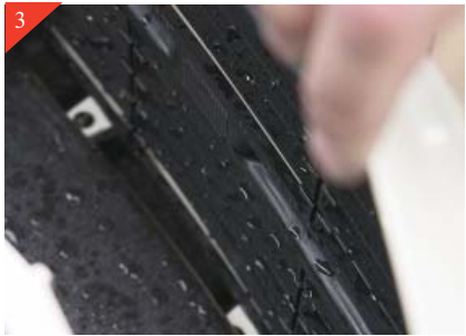
3 Pull the bottom grille inserts out slightly away from the energy absorbent foam to expose (4) screws holding the inserts in place and remove the screws.