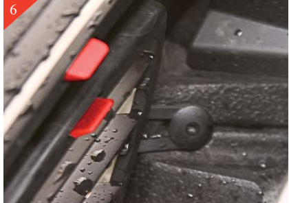
6 With the top tabs released from step 5 the top portion of the insert will need to be pulled back and the tabs marked in Red released. Do so by squeezing together.