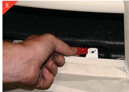
8 Next attach the supplied L-brackets to the factory mounting tabs in the lower portion of the grille shell. By placing U-clips on the factory tabs then attaching the L-brackets to the clips using #8 x 5/8" screws.