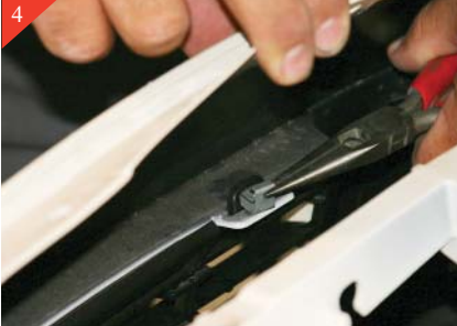
4 Squeeze the (2) Metal Clips in the Top horizontal bar holding each grille insert in place to release.