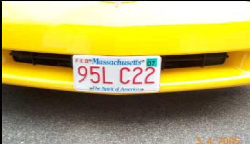
Plate without Frame