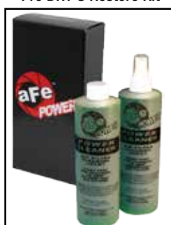
Pro DRY S Restore Kit