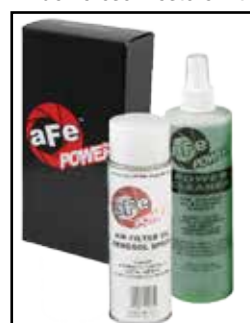
Blue Aerosol Restore Kit