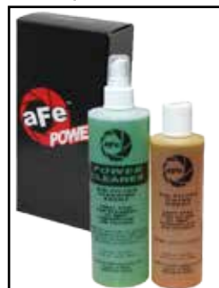
Gold Squeeze Restore Kit