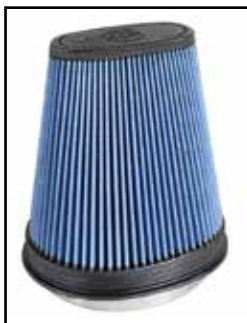
Pro 5R Air Filter