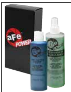
Blue Squeeze Restore Kit