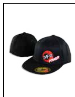
aFe Power Hat