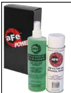
Gold Aerosol Restore Kit