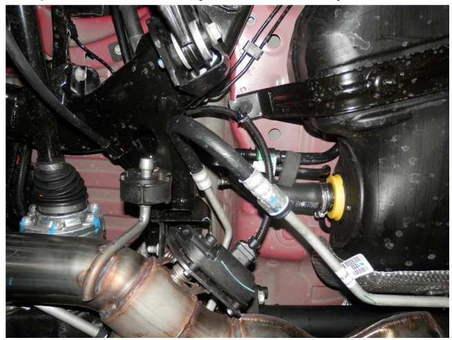
Step 6. To re-connect the wiring harness plugs to the Valve motors you may need to cut their plastic anchors. After having done this attach the plugs to the motors and re-anchor the wires with a supplied Zip Tie.