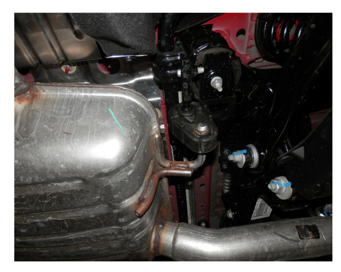
Step 3. Working front to rear disengage all welded hangers from the rubber insulators and remove the system. (Retain the insulators as they will be needed to mount the new MAGNAFLOW system.) Once the OEM system is on the ground transfer all the valve motors over to the new Magnaflow exhaust system.