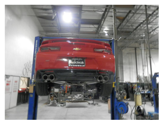
Step 7. Once a final position has been chosen for the new exhaust system, evenly tighten all clamps from front to rear using the torque specifications on page one of the instructions. Inspect all fasteners after 25-50 miles of operation and re-tighten if necessary.