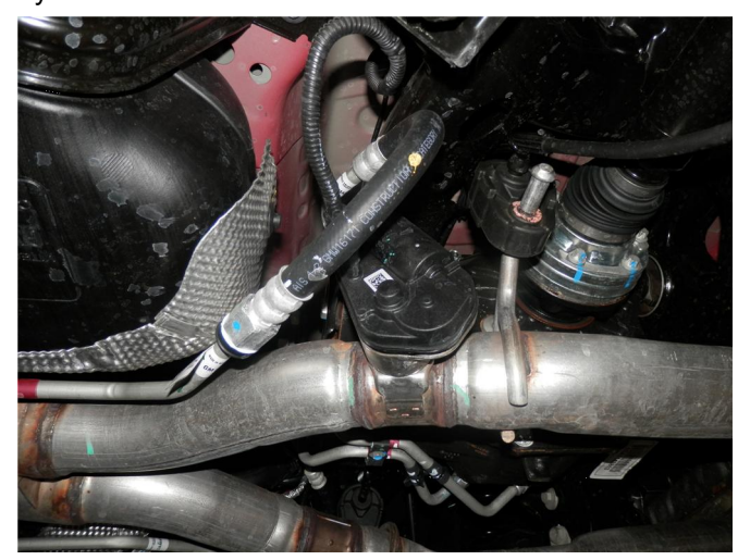
Step 2. Next you will need to unplug the electrical connection on the Exhaust Valve Control Motors (Qty 4) located on the OEM exhaust assembly.