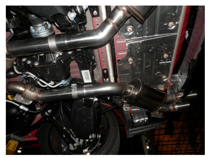
Step 5. Install the Muffler Assemblies to the X-Pipe Assembly with the supplied 3.00" clamps and engage the welded hangers to the rubber insulators. Leave all clamps loose for final adjustment of the system.