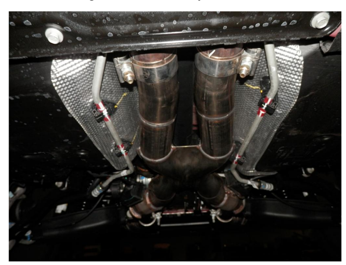
Step 4. Begin installation of the new system by sliding the X-Pipe Assembly inlets onto the cut outlets of the OEM exhaust and loosely fasten with the supplied 2.75" clamps. (at this time slide the loose end of the cut heatshield under the clamps before tightening). Fit hangers into rubber insulators.